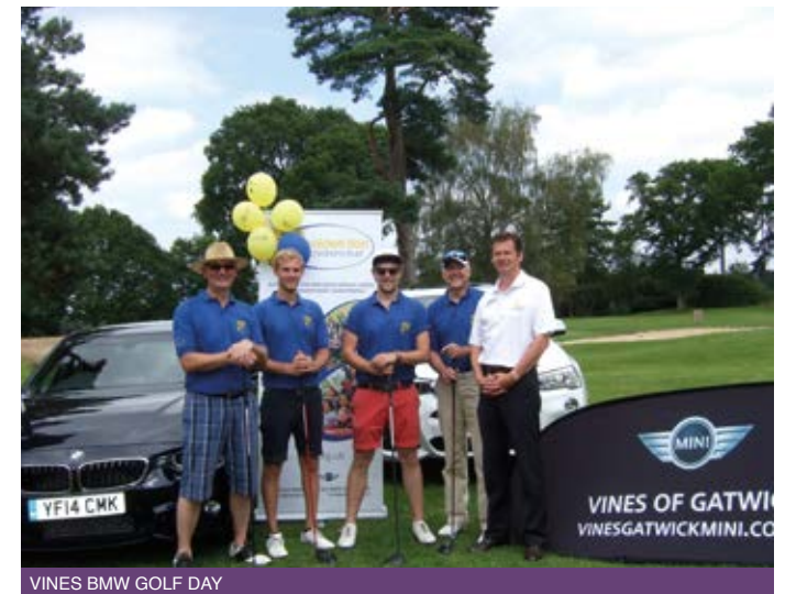
VINES BMW GOLF DAY