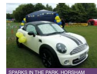
SPARKS IN THE PARK, HORSHAM