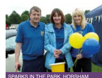
SPARKS IN THE PARK, HORSHAM