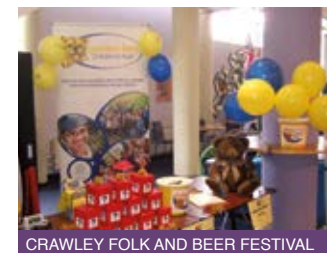
CRAWLEY FOLK AND BEER FESTIVAL

As an independent charity, fundraising for the Golden Lion Children's Trust is vital. These projects are an excellent way to engage with people and explain the work of the charity. Thank you to everyone who invites us to their events; to all the helpers who make these projects work; and to all of you who join in the fun and generously donate to the GLCT.