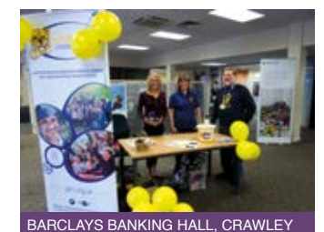
BARCLAYS BANKING HALL, CRAWLEY