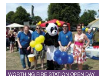
WORTHING FIRE STATION OPEN DAY