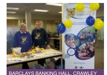
BARCLAYS BANKING HALL, CRAWLEY

Did you know you can help GLCT fundraise without leaving home?