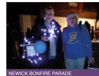
NEWICK BONFIRE PARADE