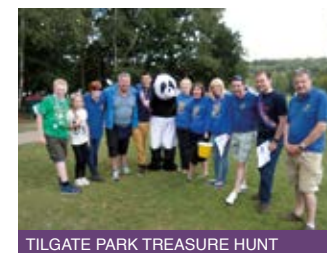
TILGATE PARK TREASURE HUNT